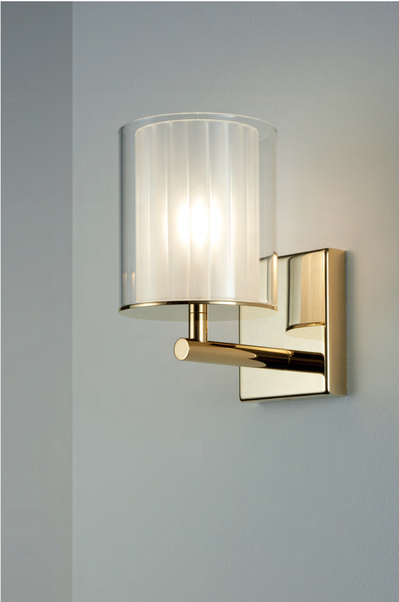
Flute Wall Light XL